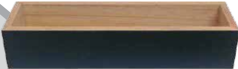
Chalkboard Crate Z-CHALKCRATE