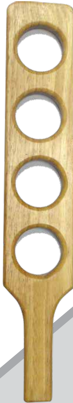
4 HOLE SAMPLER PADDLE