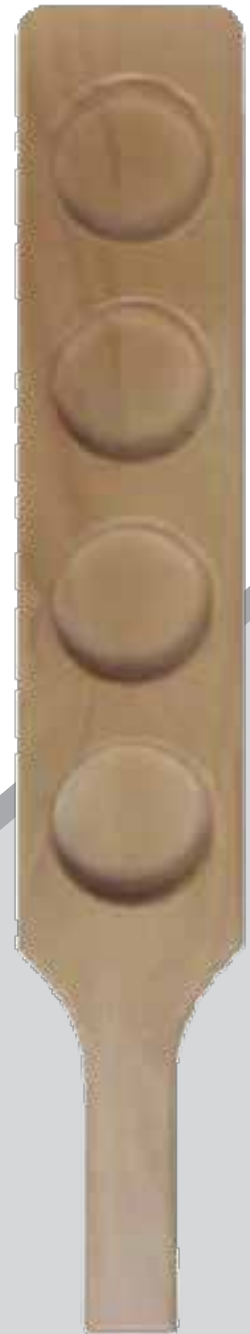
CLOSED BOTTOM SAMPLER PADDLE