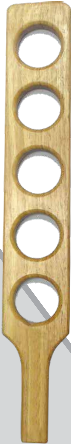
5 HOLE SAMPLER PADDLE